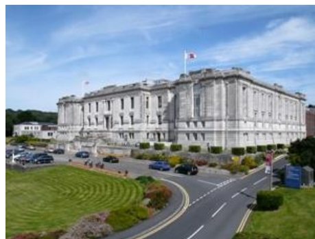
Figure 6. The university in Lampeter (left) and the National Library of Wales, Aberystwyth (right). Opened in 1822 as St David's College, Lampeter is the oldest degree awarding institution in England and Wales outside Oxford and Cambridge. It is now part of the University of Wales, Trinity Saint David. The National Library was founded in 1907 and is the largest library in Wales holding over 6.5 million books and periodicals.

In line with national trends, which indicate an increasing demand for rail transport, both Aberystwyth and Carmarthen stations have shown a marked increase in passenger footfall in recent years. Office of Road and Rail data show that for Aberystwyth, the increase has been 21.65% over the past 15 years (2018/19: 309,000; 2004/5: 254,000), while the figures for Carmarthen show a 30.4% increase (2018/19: 383,386; 2004/5: 294,000) over the same