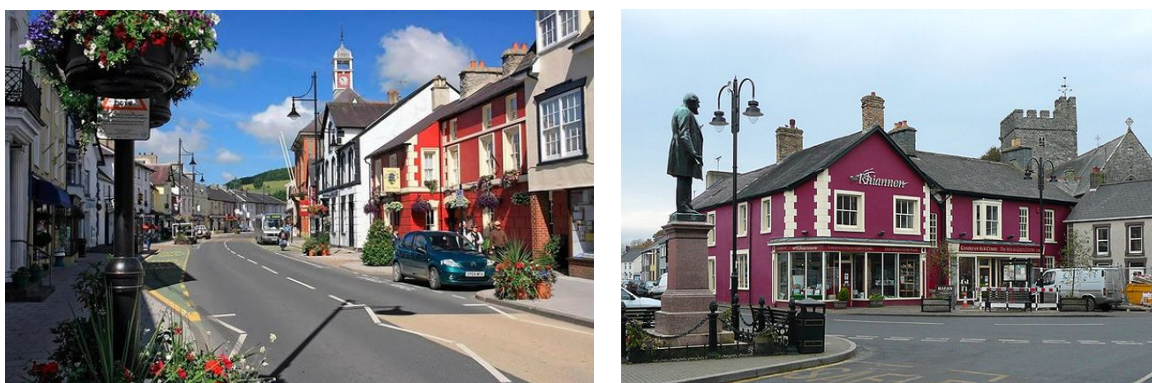
Figure 7. Two important market towns along the line: Lampeter (left) and Tregaron (right), the latter showing the statue in the town square of the Victorian peace campaigner, Henry Richard.

The fact that a rebuilt line would connect further and higher education institutions along its corridor is an important factor in developing social inclusion, personal development, attainment, and aspiration. Again, given the importance of universities in West Wales (universities provide 20% of employment in Ceredigion and Carmarthenshire), it is surprising that the Feasibility Study is largely silent on students as potential passengers on the line as the re-opened railway will link four university campuses: Aberystwyth, Lampeter, Carmarthen (which now includes the headquarters of the S4C television channel) and Swansea. It will also link further education colleges in Aberystwyth, Carmarthen, Llanelli and Swansea. Ultimately, there will be a direct rail connection between these educational institutions and both the university and further education college in Bangor. In addition, the line will connect Cardiff, Swansea, Carmarthen and Lampeter campuses with the National Library of Wales in Aberystwyth. The new line would be of particular benefit to students at Trinity Saint David, which is based on three campuses (Swansea, Carmarthen and Lampeter). Currently Lampeter is the only university in Wales and England not currently served by a railway line, and the lack of a rail connection has often been cited as one of the reasons for Lampeter's student recruitment problems over recent years.