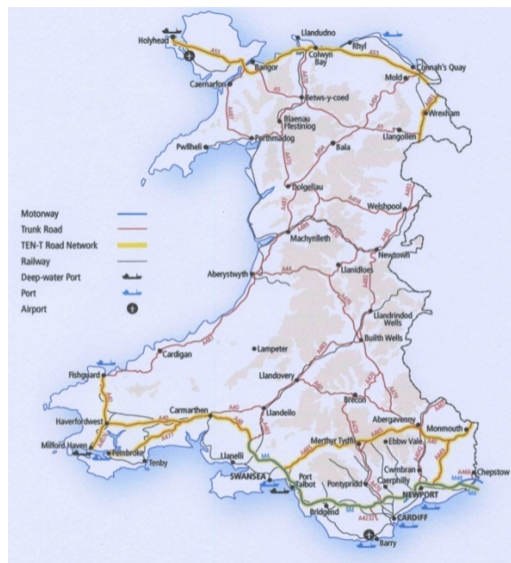
Figure 1. A road/rail map of Wales showing the large gap between Aberystwyth and Carmarthen with no railway connection and no major roads. This means that the whole area is particularly poorly served by public transport. From Welsh Infrastructure Investment Plan for Growth and Jobs, 2012. Welsh Government, Cardiff.

Unlocking this potential requires considerable inward investment, vision and planning, but a major requirement is a significant improvement in transport network, both within the region itself, as well as outward to the nearby urban centres of South Wales, the English Midlands, and Merseyside and Manchester. Poor transport connectivity and access to markets and services has been recognised as a major infrastructural weakness by previous economic assessments (see, for example, Framework for Action Plan produced by the Growing Mid Wales Partnership , 2016, and Rural Wales – Time to Meet the Challenge , 2017, by Baroness Eluned Morgan). Currently, the road system in Mid- and West Wales in particular is inadequate for the region’s needs, and while the existing railway links eastwards from Bangor and Aberystwyth, and east and west from Carmarthen, are both well-used, they do little to improve regional connectivity (Figure 1).