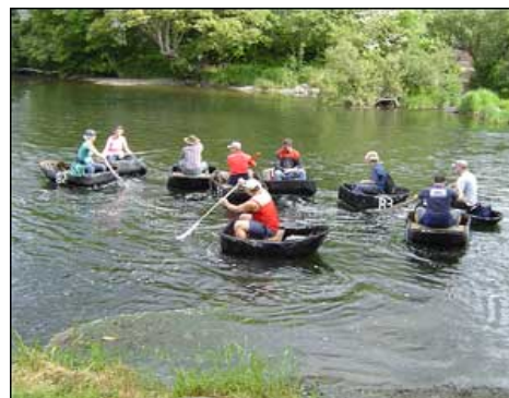
Figure 9. Tourist activity in the Teifi Valley. Cycling on the Ystwyth trail along the old track-bed of the railway line (left); coracles in the river at Cenarth near Newcastle Emlyn (right).

Moreover, the 87 km-long Cambrian Coast Line between Machynlleth and Pwllhelli has itself been described as one of the world's most scenic railways, and has featured in two recent (2019) national TV documentaries by British Broadcaster Channel 5 and by the German Broadcaster SWS. The Cambrian Community Rail Partnership estimates that the line attracted more than 460,000 additional visitors to the region in 2019.