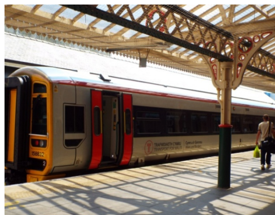
Figure 4. Aberystwyth station. Built by the Great Western Railway in 1925, it is now a Grade II listed building. On the right is a Transport for Wales train recently arrived via the Cambrian Line from Shrewsbury.

With a number of uncertainties regarding the precise location of the route, it was only possible to give an indicative cost for the rebuilding of the line which could be up to £505 million (2015 prices). Land and consent costs could add a further £250 million bringing the total project costs to around £750 million. It was estimated that a full Feasibility Study could cost in the region of £350,000.