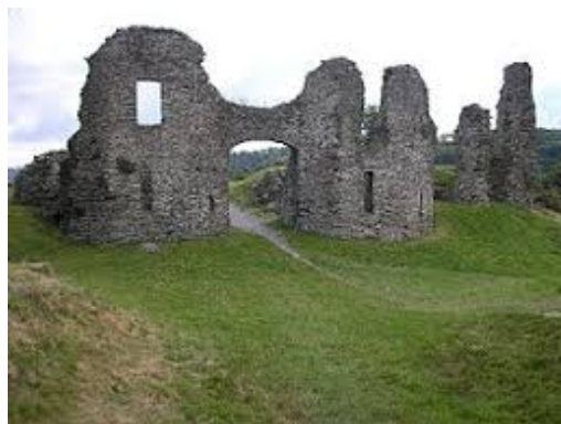
Figure 8. Tourist attractions in the Teifi Valley area: Strata Florida, a former Cistercian Abbey near Tregaron, founded in 1164 (left), and the ruins of Newcastle Emlyn Castle which was probably built by the Welsh Lord Mareddud ap Rhys around 1240 (right).