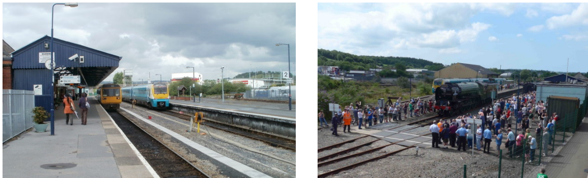
Figure 5. The southern terminus of the line at Carmarthen station. On the right is the station at the time of the visit of 60163 Tornado. Steam-hauled excursions frequently terminate at Carmarthen and attract large numbers of visitors to the town.

Transport Finance Plan, 2015. Moreover, the Feasibility Study acknowledged that good public transport connectivity is key to helping rural communities, who may experience deprivation as a result of fewer employment and education opportunities. Economic growth across Ceredigion and Carmarthenshire is therefore dependent on accessibility in terms of the highway network and access to public transport. The re-opening of the Aberystwyth to Carmarthen railway reflects the over-arching policy objectives as set out in these various documents, especially as several highlight the un-sustainability of car use.