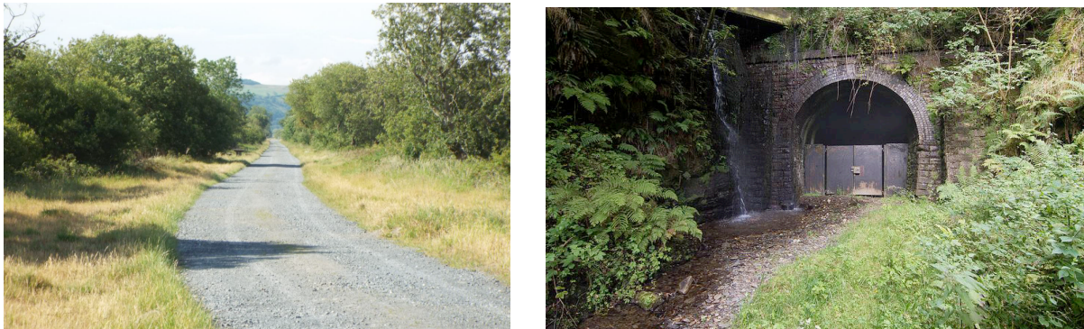
Figure 10. Left; the railway track-bed across part of Cors Caron with the Cambrian Mountains in the background. Right: the south entrance to Pencader Tunnel. At 901m, this is the longest of the three original tunnels along the line and was opened on 1 st April 1864

The historic problems with the sections of the line adjacent to the Ystwyth River, near Llanilar, and crossing Cors Caron, near Tregaron, have been addressed in the Feasibility Study. Solutions have been proposed and appropriate costs have also been included in the Feasibility Study.